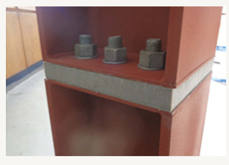
↓ FIGURE 6: TBF sections before fire test