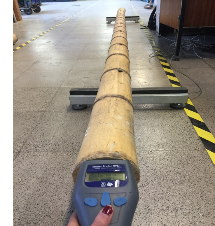
Brookhuis Timber Grader MTG ®

A four-point bending test was then conducted to determine the Static Modulus of Elasticity, Modulus Rupture the of (strength) the bending and of capacity each moment specimen. The test configuration is shown to the left.