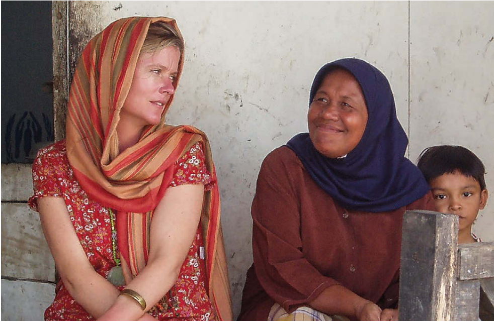
↑ FIGURE 3: Carrying our community consultation in Aceh, Indonesia for Oxfam- Muslim Aid

investments. 'It was 2006, there was a building boom. I was very much swimming against the tide,' she says.