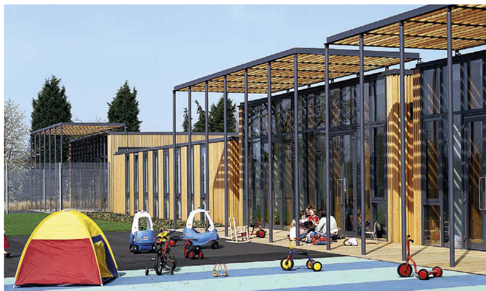
FIGURE 5: Lavender Nursery, Mitcham, London

and steel. We need to be talking about industrialised construction, minimising and tracing materials and the use of renewables. And we need to do it quickly. Above all, we as engineers need to step up to the big challenges facing the world, and find the solutions. No other profession is better placed to do so.’