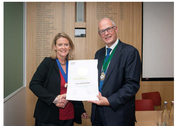
↓ FIGURE 4: Receiving IStructE Gold Medal in 2017

The issues that da Silva has been focusing on in the developing south are issues that increasingly apply