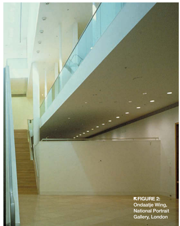
FIGURE 2: Ondaatje Wing, National Portrait Gallery, London